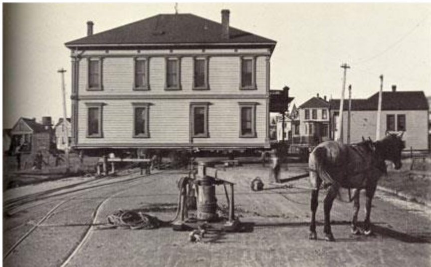
Built in 1884, Berkeley’s first Town Hall was moved in 1899 from University Ave. at Sacramento St. to Grove St. at Allston Way. (Berkeley: The Town & Gown of It)