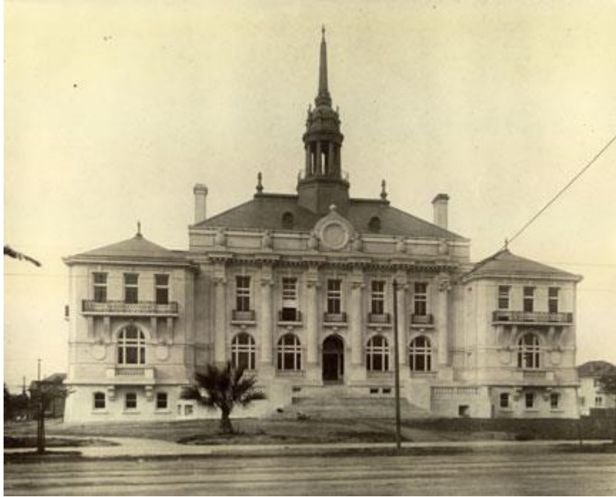
Berkeley City Hall, designed by Bakewell & Brown, shortly after its completion in 1909.