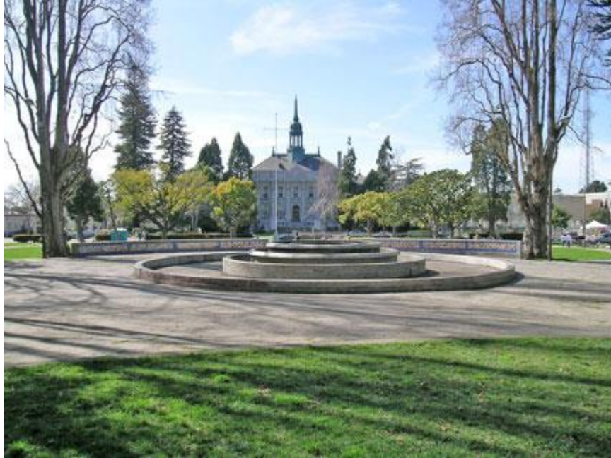
Civic Center Park