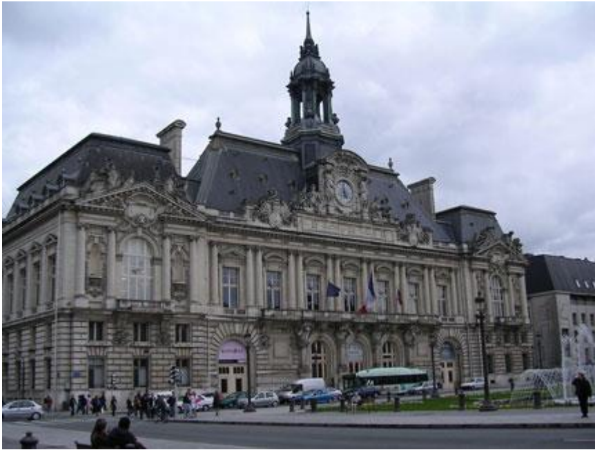
The Hôtel de Ville of Tours served as inspiration in the design of our City Hall.

attic sparked a blaze that burned the entire structure to the ground within an hour.